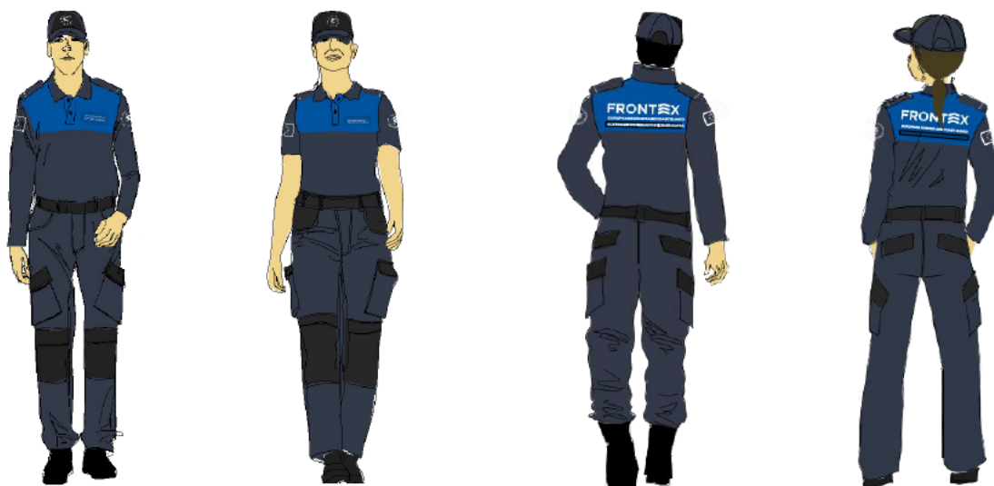
Figure 2 Standing corps uniform design

The specifications and design of the Uniform was presented to the Management Board in February 2020. The associated documents were submitted to the Commission in March 2020 and the official the Commission's official opinion is expected in May 2020.