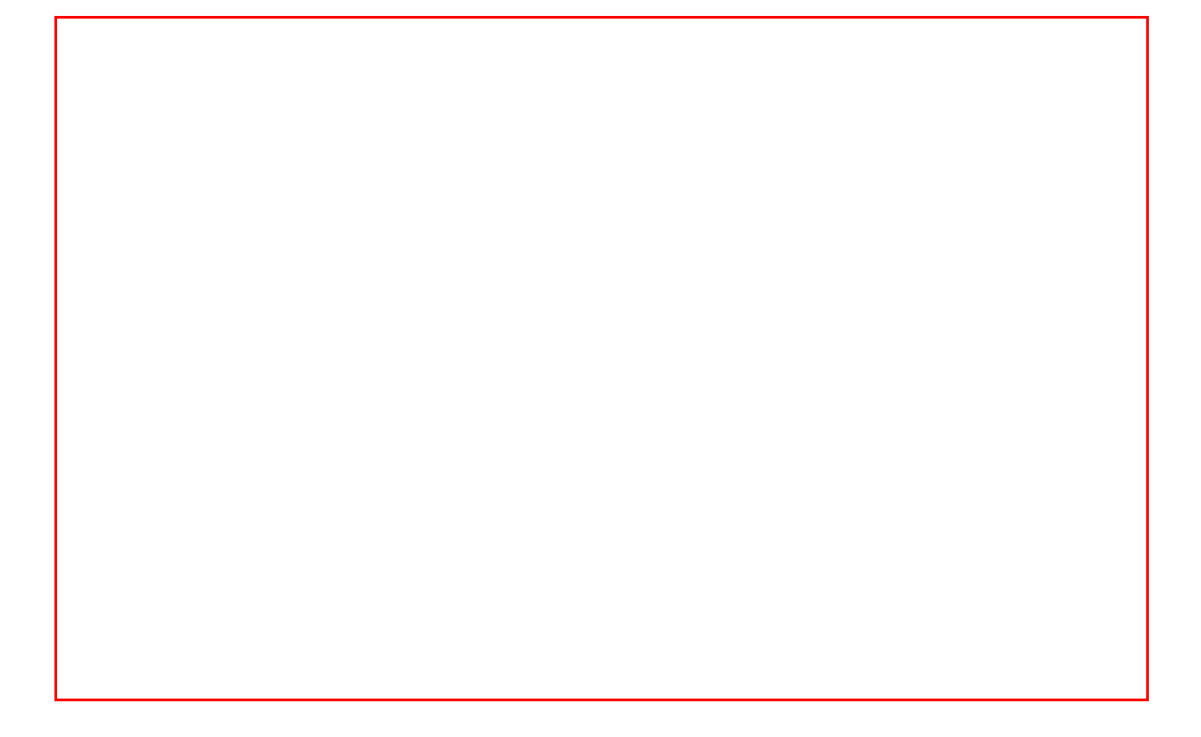
Chart 7. Impact of introduction of new riot weapons on the level of political killings in Northern Ireland