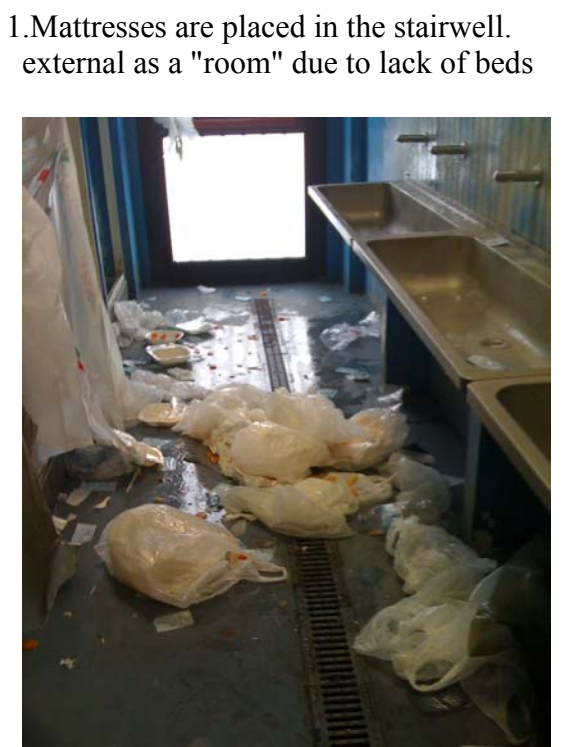
3. Corridor of toilet