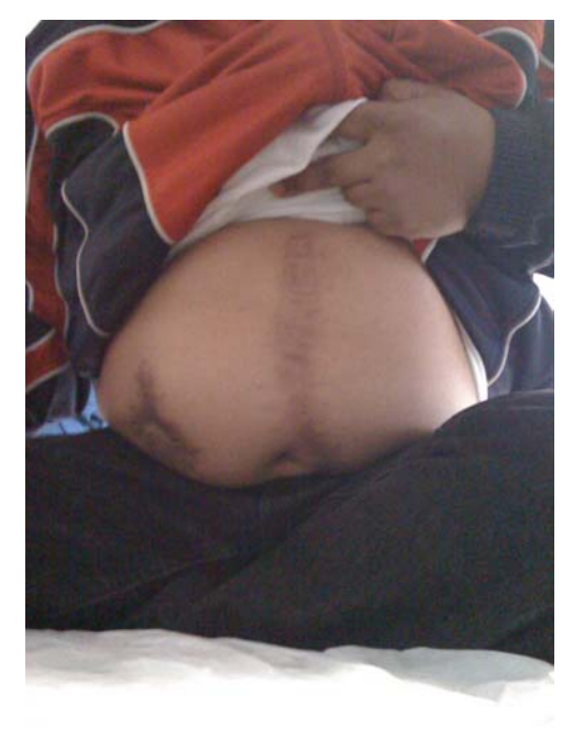
5. Migrants need appropriate medical care but there is no systematic health screening