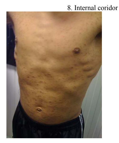
9. Skin disease caused by poor conditions of hygiene