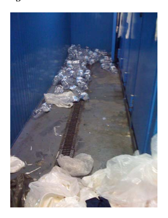
2. Corridor of toilet