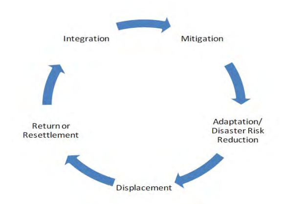
Figure 2: Life cycle of climate-induced migration

resettlement to another location and the final stage of (re)integration either into the home or new location and society. 127