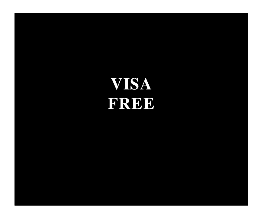
PART B2: 'all passports'."