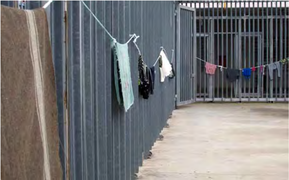
CIE of Rome, Ponte Galleria. May 2013.