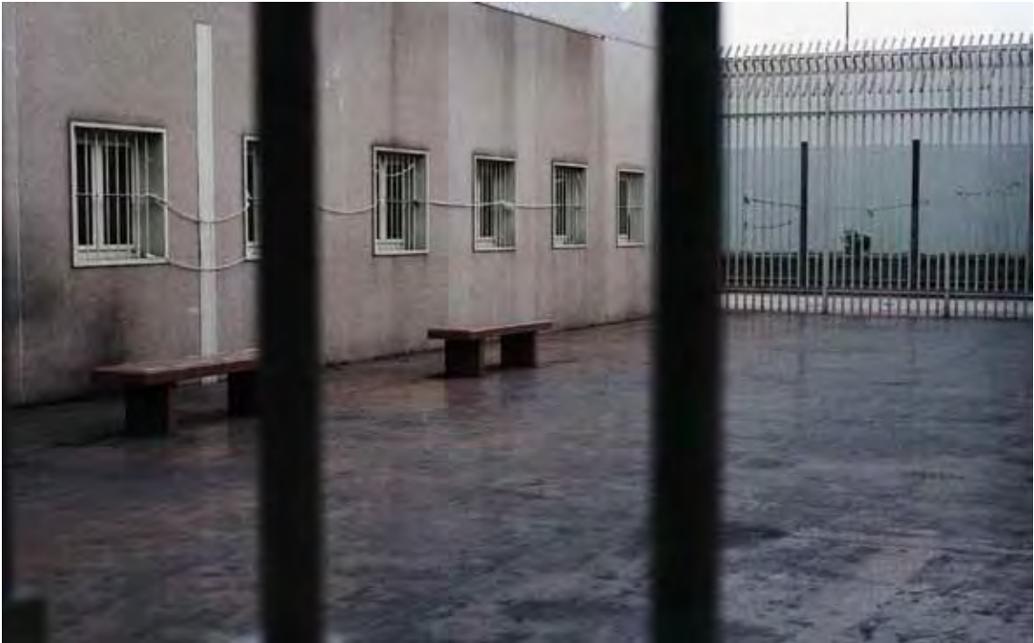
Below: CIE of Bari, Palese. February 2013.