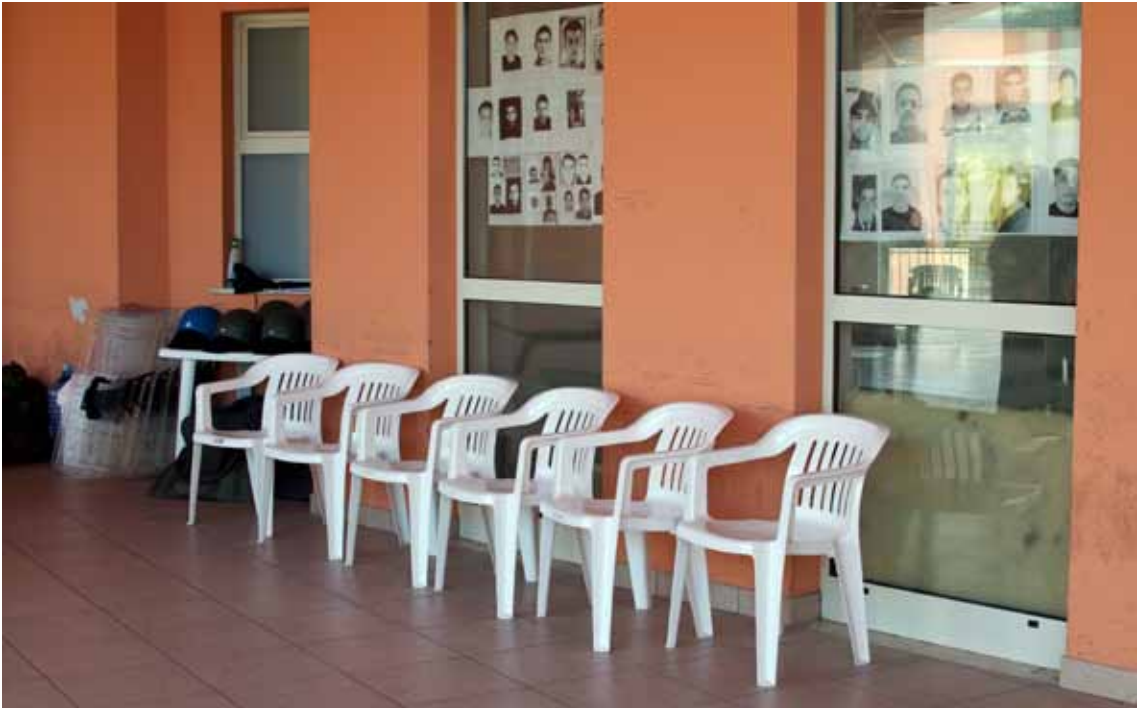
CIE of Trapani, Milo. February 2013.