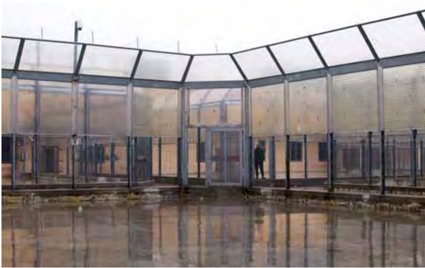
CIE of Modena, Strada Sant'Anna. Marzo 2013.