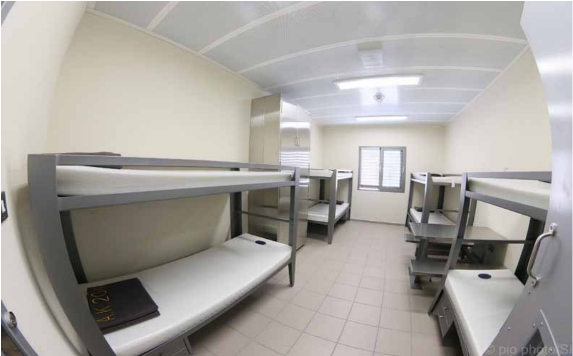
Above: Detention Center of Mennogia, Cyprus, 2013.