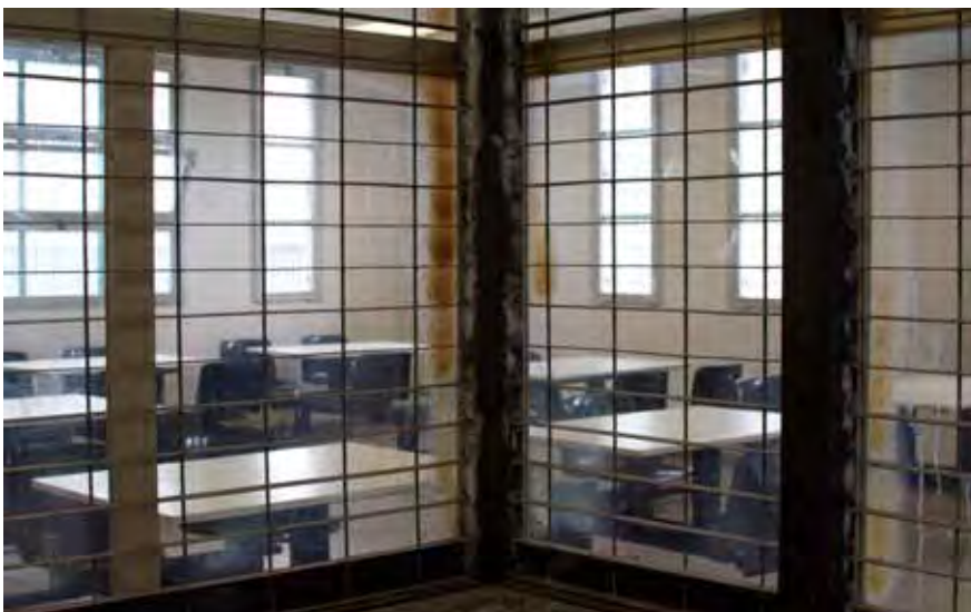
CIE of Rome, Ponte Galleria. May 2013.