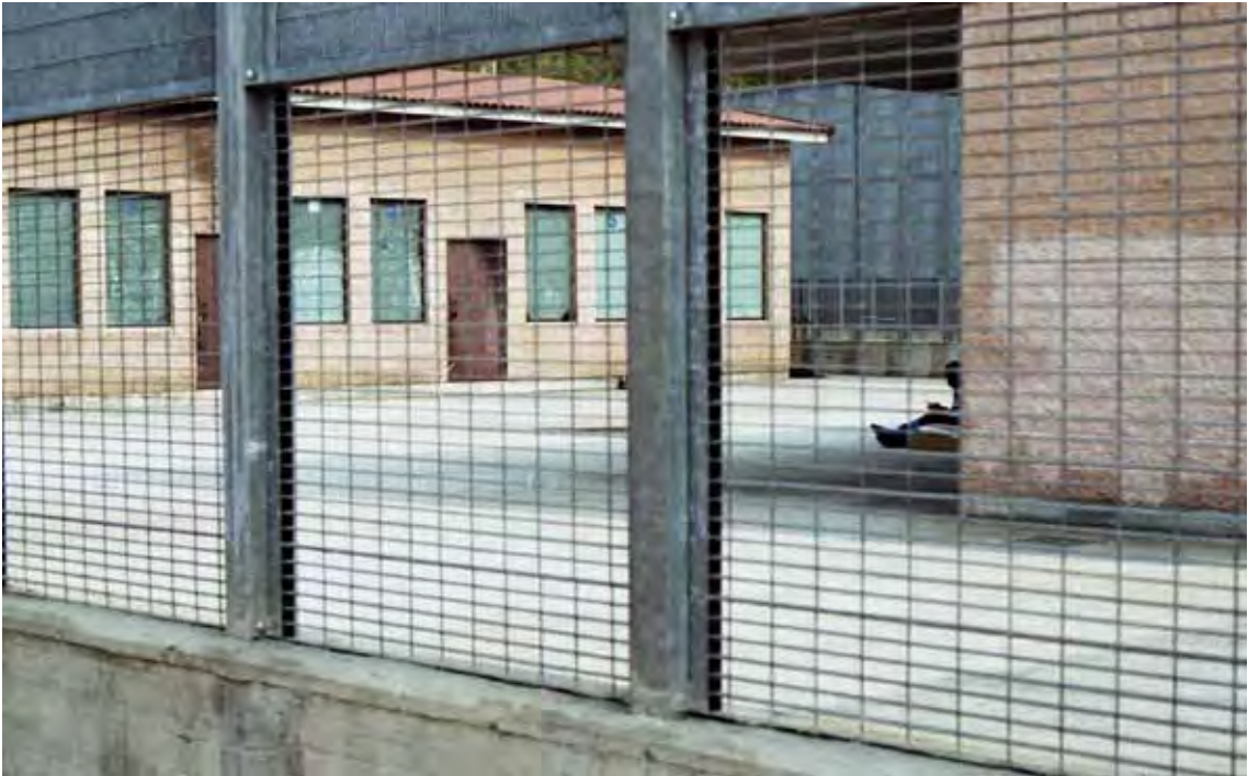
CIE of Turin. October 2013.