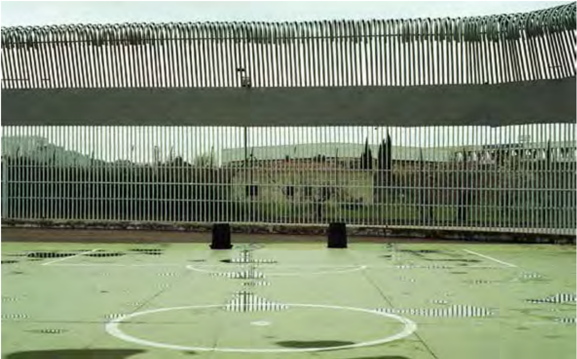
CIE of Caltanissetta. February 2013.