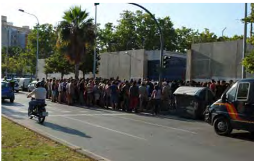
CIE of Valencia. June 2013.