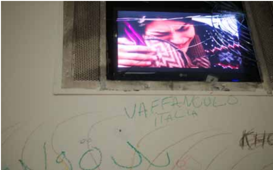
CIE of Modena, Strada Sant'Anna. Marzo 2013.