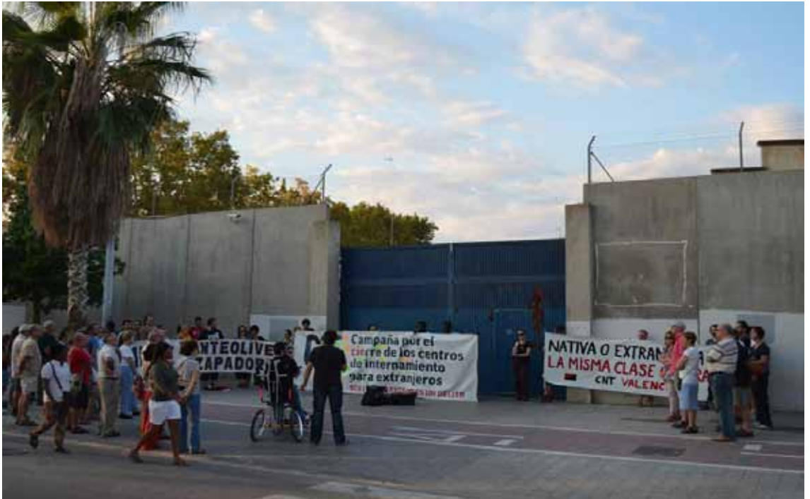
Above: Detention Center of Mennogia, Cyprus, 2013.