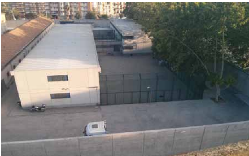
CIE of Valencia.