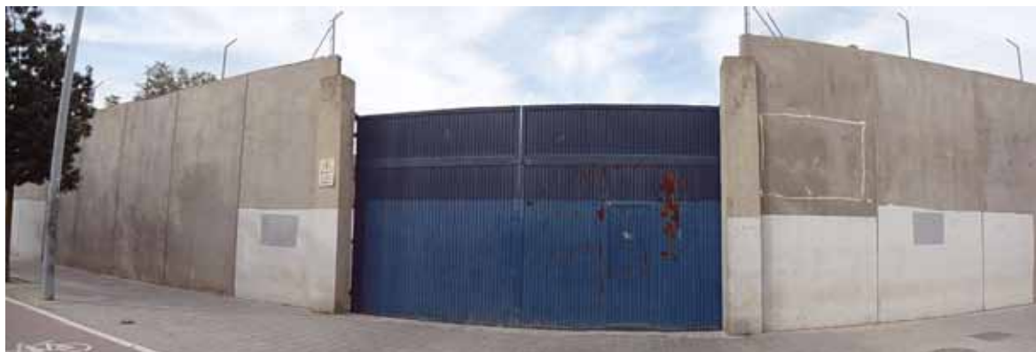
CIE of Valencia. Entrance gate.