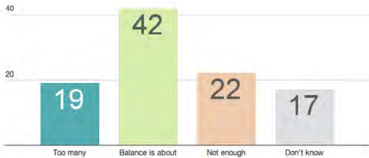
Figure 2: ‘Do you think the British security services (such as MI5) have too many powers to carry out surveillance on ordinary people in Britain, too few powers to carry out surveillance, or is the balance about right?’ (%)