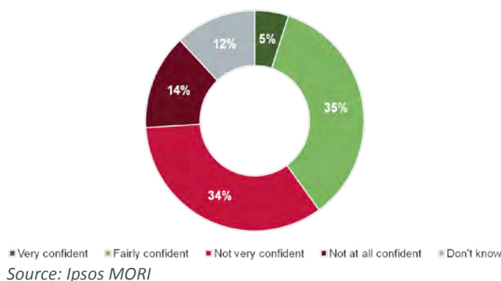
Figure 3: 'Currently, the UK's intelligence agencies are held to account on behalf of the public by a committee of politicians. How much confidence, if any, do you have in the current system of holding the intelligence agencies in the UK to account?'

these agencies'. 36 These criticisms over its membership, outputs and degree of independent scrutiny have contributed to the deficit in public confidence, as illustrated by an Ipsos MORI survey from May 2014, shown in Figure 3.