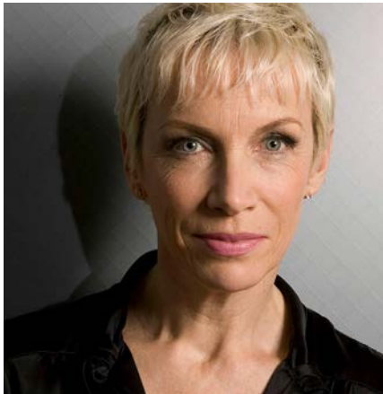
Annie Lennox of the Eurythmics (OBJ Eurythmics)