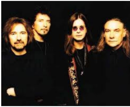
Rock band Black Sabbath (OBJ Black Sabbath)