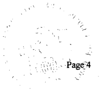
JAMES É. BOASBERG Judge, United States Foreign Intelligence Surveillance Court

FISC, certify that this document is a true and correct copy of the original