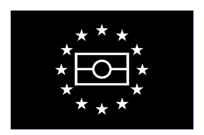
Part D1: ABC lanes for EU/EEA/CH citizens