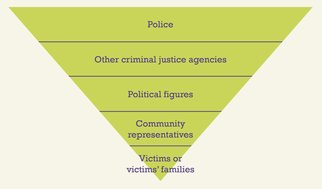
Figure 6 A hierarchy of interpretation in terms of racist/racial violence

The criminal justice system does not just have a role in providing information as to which incidents of racist violence to look at, our sample indicates that the media invariably looks to the police too, to interpret such violence. According to our data, there is a hierarchy of interpretation which, in practice, means that when the media seeks to give meaning to an incident it turns (respectively) to the police, other criminal justice agencies, political figures, 'community representatives' and, finally, victims or victims' families.