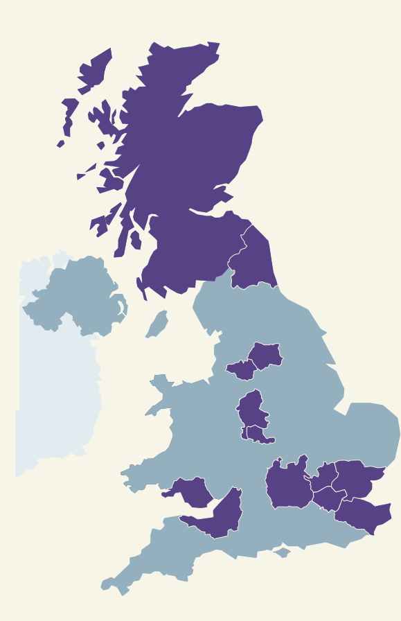
Figure 4 The fifteen police forces with the highest number of racial incidents between 24 June and 23 July 2016.

Through the Freedom of Information Act we obtained data on the number of racist incidents recorded by each police force in the month after the referendum. (See figure 4, below, for the figures from the fifteen forces with the greatest number of incidents.)