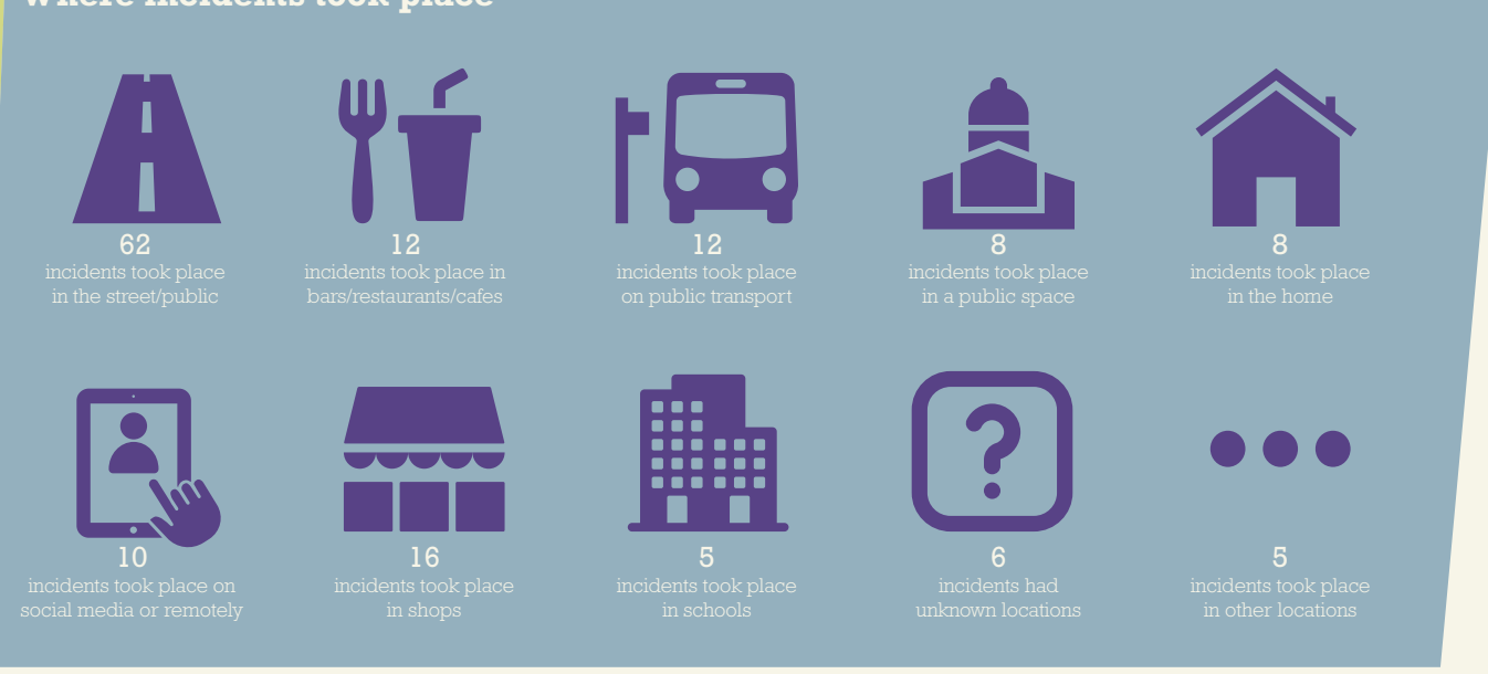
Figure 11 Where incidents took place

In twenty-nine cases, the incidents involved attacks on property. And this ranged from graffiti to (in three examples) arson. In one high profile incident, a Polish family's garden shed was destroyed in an arson attack, and they were left a note threatening worse if the family did not 'go back to your fucking country'. Graffiti typically stated that people from the EU should 'go home'.