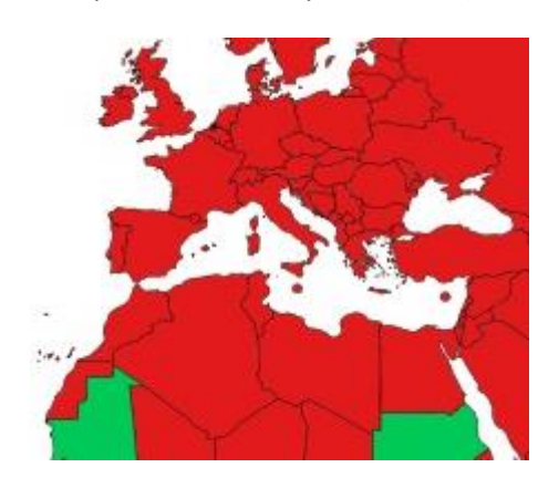
Visa requirements for Syrians 2016

Islands: Externalisation and Communautarisation in the Social Construction of Borders, Journal of Immigrant and Refugee Studies 12(2014), p. 123-142; A. López-Sala: Exploring Dissuasion as a (Geo)Political Instrument in Irregular Migration Control at the Southern Spanish Maritime Border, Geopolitics 20 (2015), 513-534.