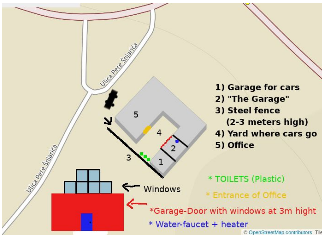
Diagram of the Korenica police station compound