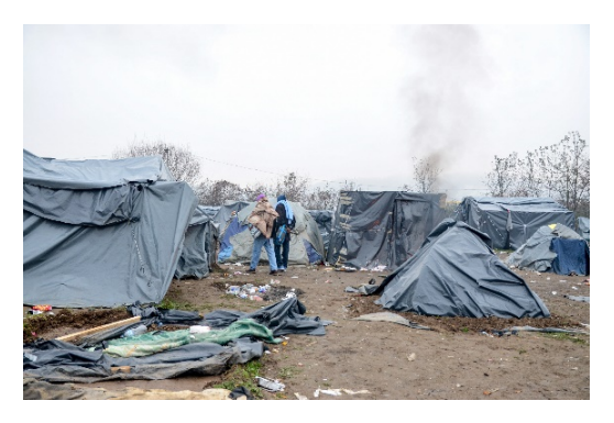
The Velika Kladuša refugee and migrant camp in Bosnia and Herzegovina.

The lack of appropriate policy responses in BiH has led to a humanitarian crisis in the Una-Sana Canton. In the absence of timely and serious preparation, and without better internal coordination among state-level and local authorities, BiH may face an even stronger humanitarian emergency this upcoming winter.